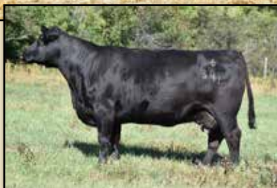
S Rita 6341 WR 7/106. Donor dam of Lot 40.