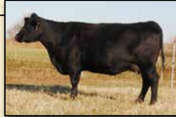
S Pride Anna 709 WR 4/114. Dam of Lot 30 as well as Summit and Whitlock.