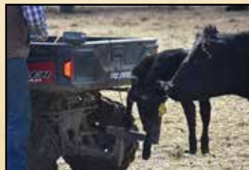
All calves are weighed on a digital scale at birth.

All carcass measurements are adjusted to 365 days of age. The bulls were scanned Feb. 18, and have actual ultrasound measurements listed. Note: The scrotals and frame scores are adjusted to a year of age. Current scrotals will be available 2 weeks prior to sale.