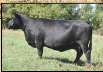
S Gloria 0406 WR 4/110. Donor dam of Lot 109.