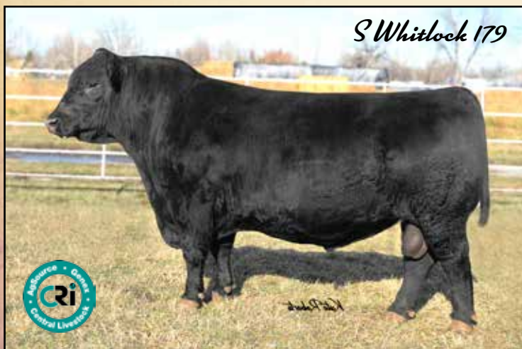
S Whitlock 179

Look for their progeny in our 2017 sales!