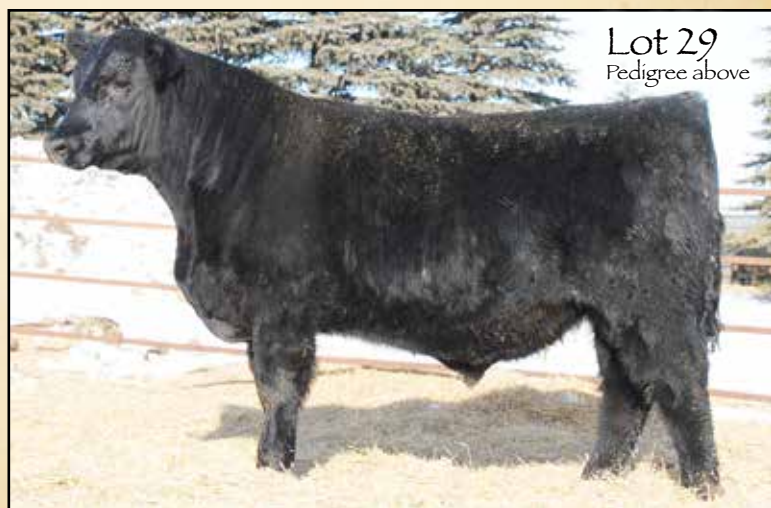
Lot 29 Pedigree above

Phenotypic stand out sired by our Hinman herd sire Open Country. His dam is a low BR solid producing daughter of S Queen Essa 208. Lot 29's dam is very tidy uddered, and small teated. Lot 29 is an attractive patterned, well balanced bull who weaned heavy and ratioed well for REA having nearly a 16 inch eye. Use this calving ease bull to add pounds, muscle and improve udders. Suitable for heifers.