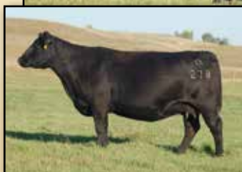
S Blossom 0278 WR 3/111. Donor dam of S Chisum 255. Her ET son by Courage sell as Lot 129.