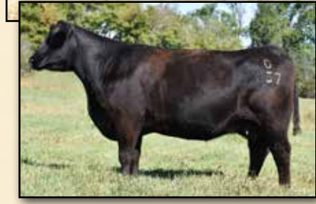
S Eblinette 0157 WR 2/120. Donor dam of Lots 14, 15 & 44.