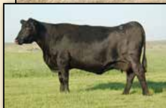
S Queen Essa 208 WR 7/110. Donor dam of S Dominión 0508. Her ET sons by Anchor sell as Lots 56, 87 & 88.