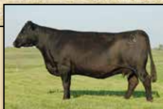
S Rosemary 247 WR 10/109. Past donor and granddam of Lot 36.

Standout calving ease bull sired by Summit. The +12 CED herd bull prospect is clean fronted, thick topped, correct in his structure and is backed by a young X Factor dam whose udder quality is second to none. Furthermore his granddam is a "VRD" daughter who is a past donor for us who recorded 10 calves with an average weaning ratio of 109. With this bull's pedigree combination of Summit and our Rosemary cow family, his maternal sire ability should be foolproof. Suitable for heifers.