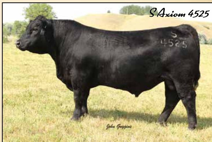
S Axiom 4525

CED +13 BW +0.8 WW +75 YW +130 M +38 MB +.64 REA +.75 $B +175.45 S Chisum 6175 x R&S Expedition 1404 x G A R Grid Maker Reg. No. 17007891