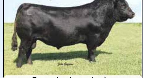
Tremendously popular sire. His sons sell and service sire on cows selling.