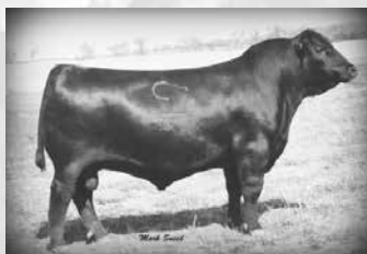
Connealy Earnan reg # 16969555