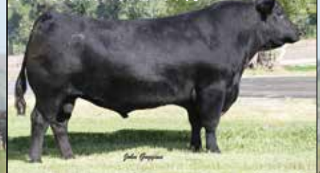
First calves on the ground, some of the best. Service sire on heifers and cows!