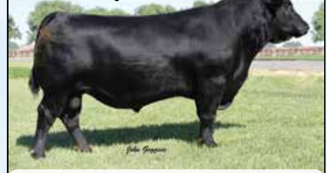
Service sire on cows and heifers. Many sons sell.