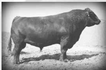
Connealy Consensus reg # 15513367