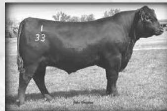
Connealy Black Granite reg # 17028963