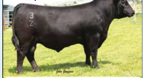
A proven calving ease sire! Sons sell and service sire on heifers and cows.