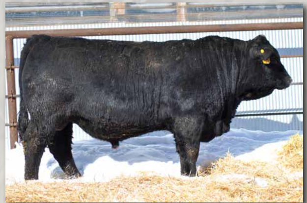
JD499 Sells as Lot 42.