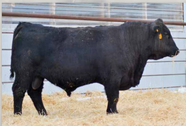
JD518 Sells as Lot 48.