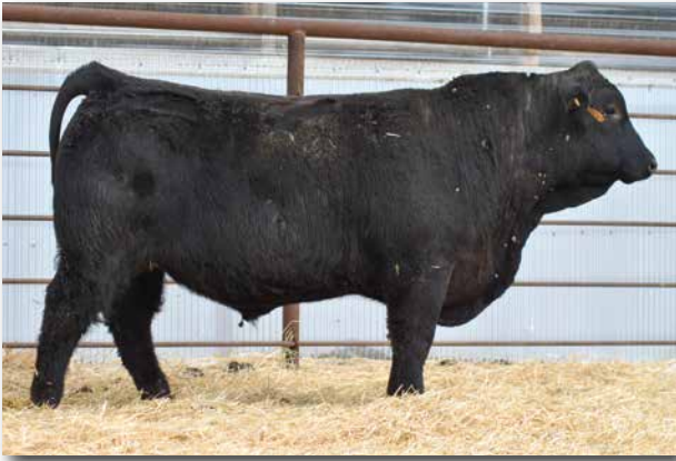
JE608 Sells as Lot 52.