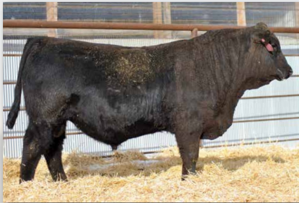
JY353 Sells as Lot 64.