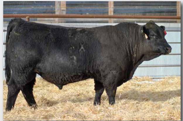
JE94 Sells as Lot 57.