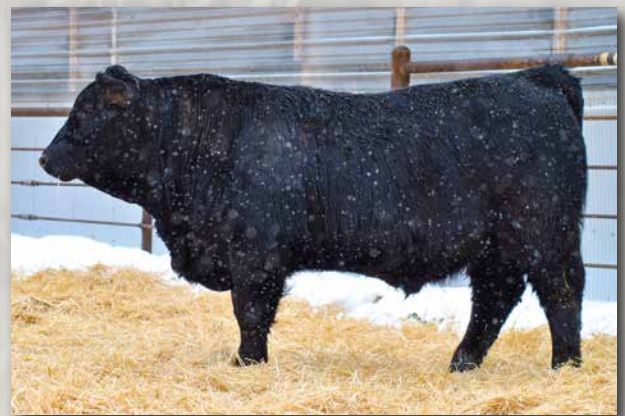
JC932 Sells as Lot 21.