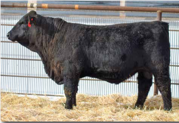
JB443 Sells as Lot 3.