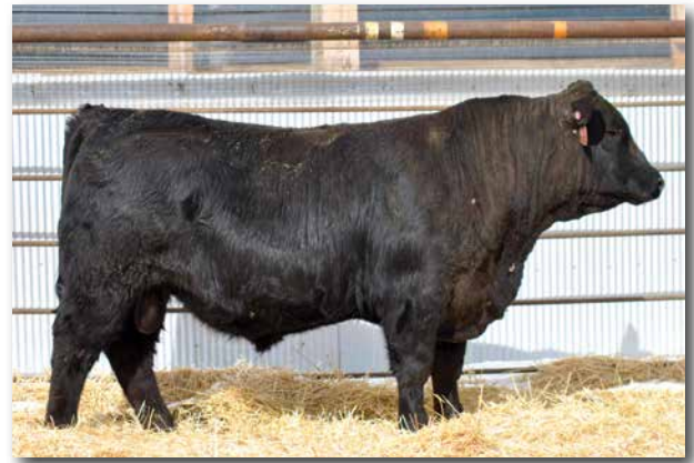
JC968 Sells as Lot 18.