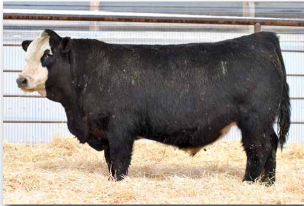
JE434 Sells as Lot 74.