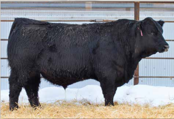
JF740 Sells as Lot 8.