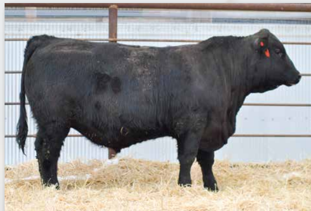
JF101 Sells as Lot 13.