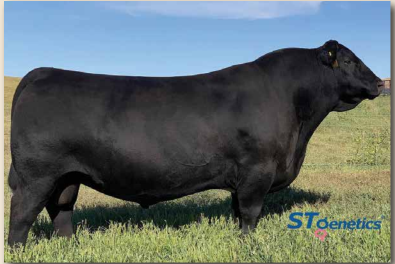
S A V TERRITORY 7225 Reference Sire.

Chosen for his unreal early growth which captures that precious front end of profit to the ranch. They will bring what Schaff does best: show up and grow hard, making crossbred matings very simple.