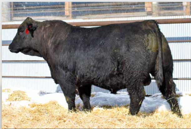
HA495 Sells as Lot 89.