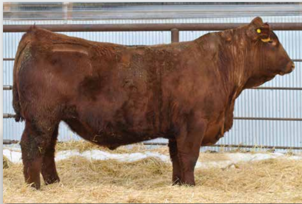
JE540 Sells as Lot 75.