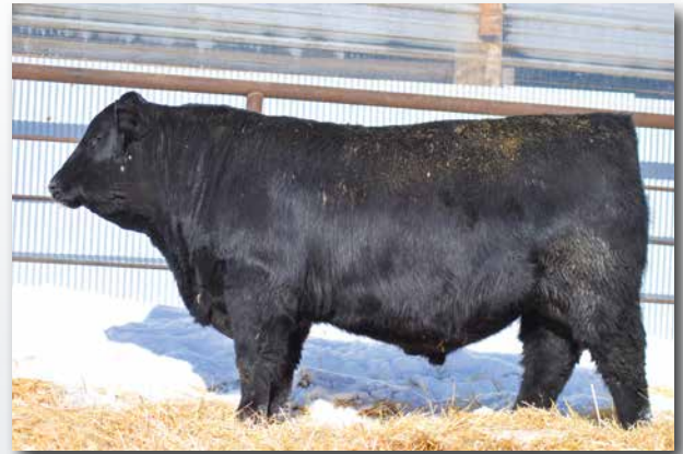
JD253 Sells as Lot 19.