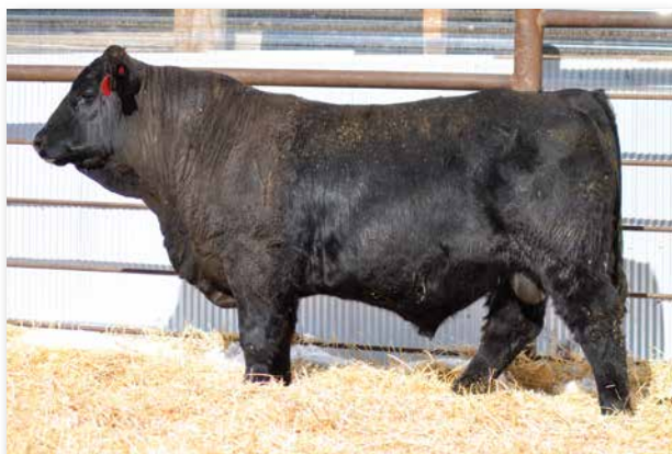
JF877 Sells as Lot 43.