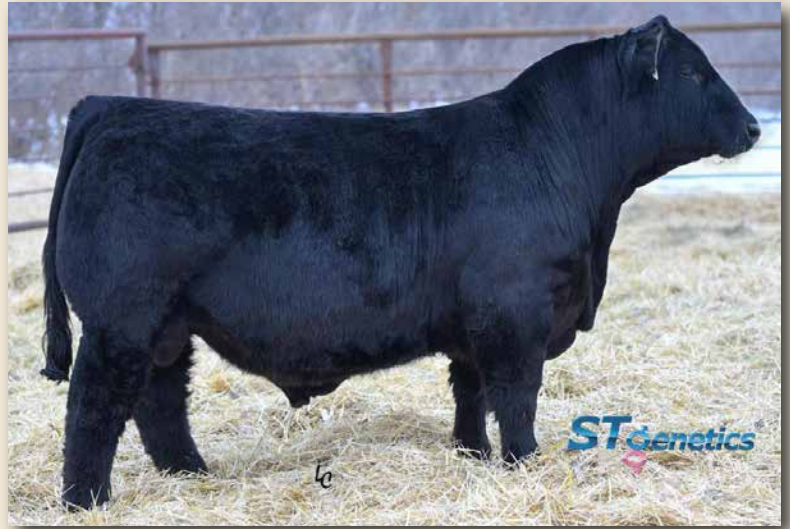
CDI TRUSTEE 387F Reference Sire.

Wide and deep and powerful, he swings back toward the foundation of Simmental performance, exceptional maternal qualities and wonderful docility. Both sons and daughters are quiet and steady. Muscle in all the right places.