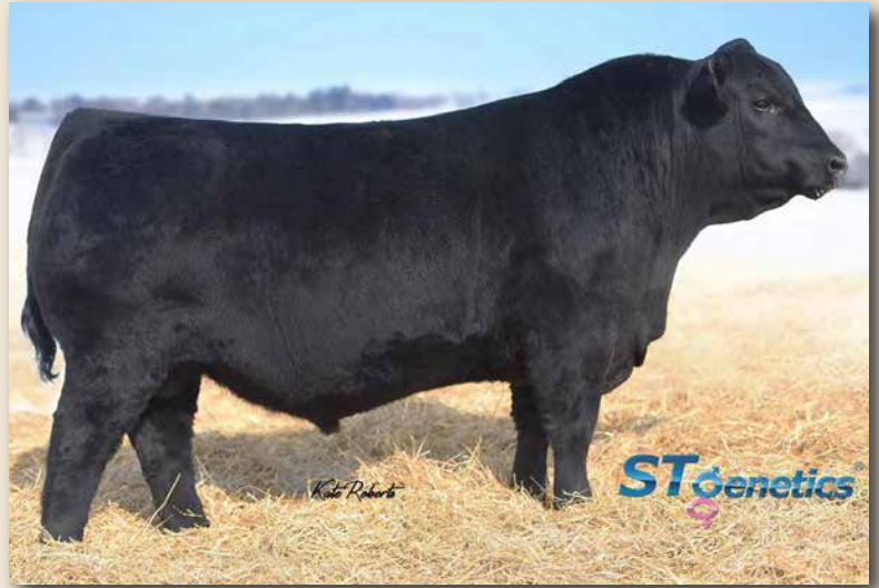
S A V RENEW 8132 Reference Sire.

Chosen for his calving ease potential and fantastic dam, this sire group will set you up to make fancy females with an excellent platform for profit.