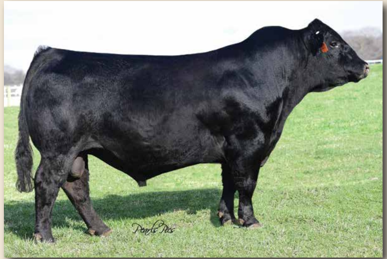
WS PROCLAMATION E202 Reference Sire.

A purebred Simmental on the path of a meteoric career in what the breed does best: tremendous performance, rib, hip and foundation to keep yield high without sacrificing maternal advantages or sensible calving ease. Build some enormously profitable cows with this set of Bulls.