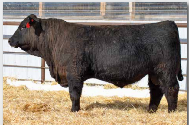
JF998 Sells as Lot 1.