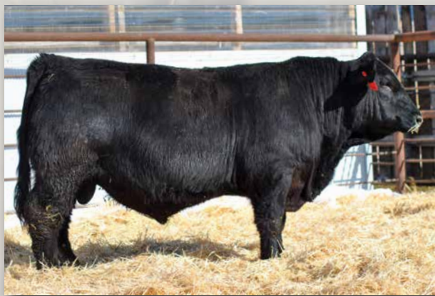
JB647 Sells as Lot 28.