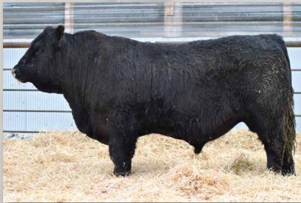
HA590 Sells as Lot 90.