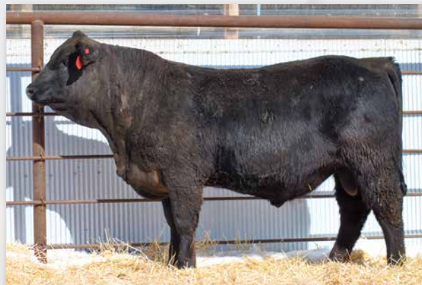
JX735 Sells as Lot 82.