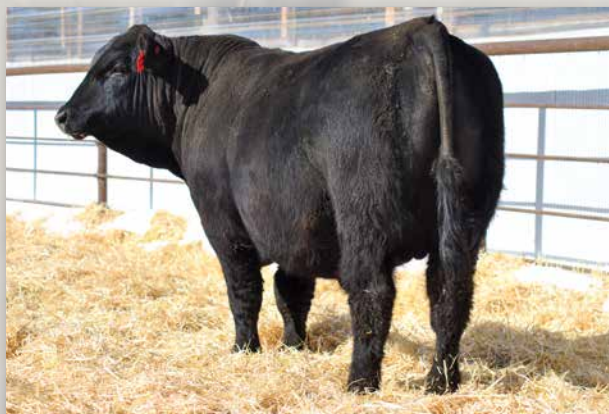
JZ971 Sells as Lot 65.