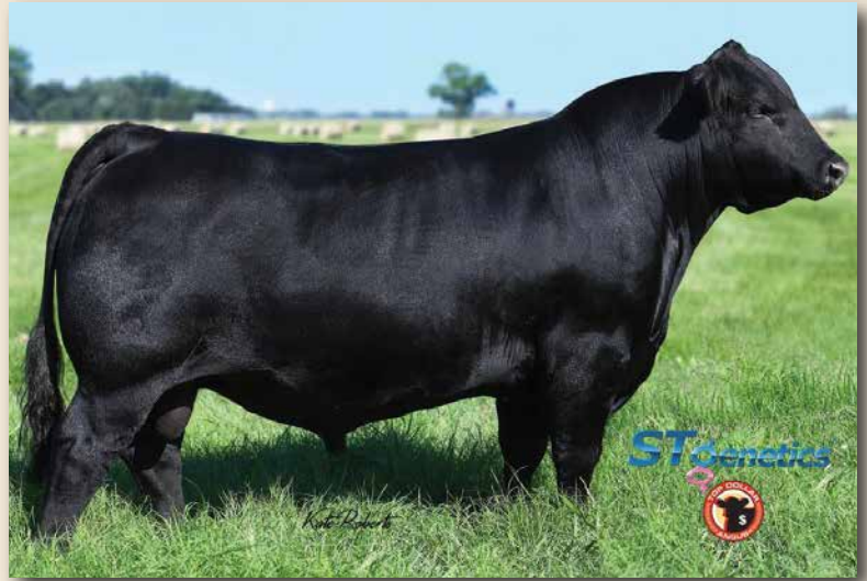
BOBCAT BLUE SKY Reference Sire.

This bull is among one of the most consistent we have ever used. Chosen for the balance point of weaning profit and extraordinary maternal history, there is persistent depth, soundness and carcass value here.