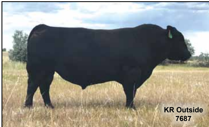
KR Outside 7687