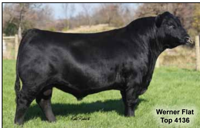
Werner Flat Top 4136

◆ CW +42, MARB +0.47, RE +0.42, Fat +0.035, $B +117