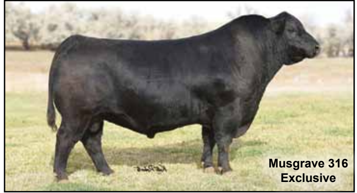
Musgrave 316 Exclusive