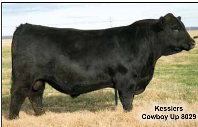
Kesslers Cowboy Up 8029