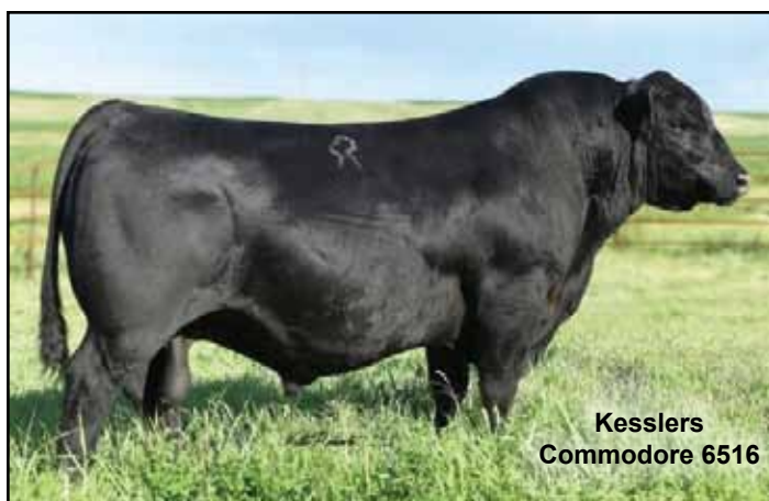
Kesslers Commodore 6516