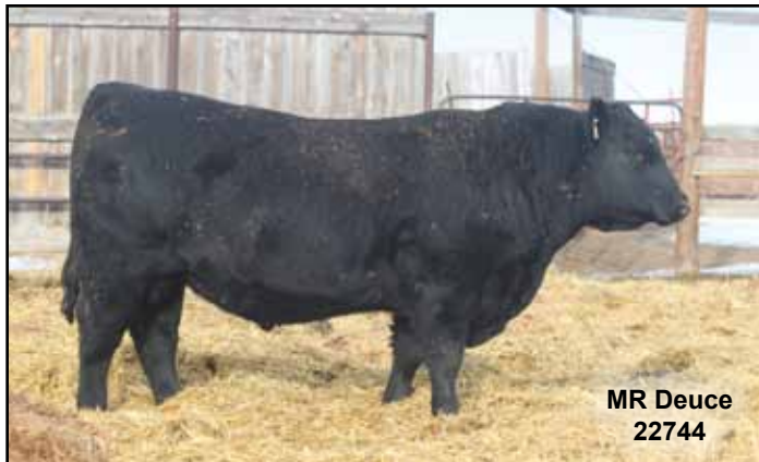
MR Deuce 22744