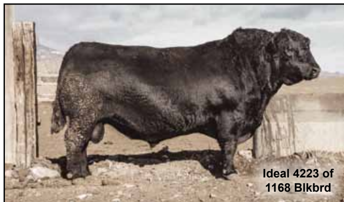
Ideal 4223 of 1168 Blkbrd