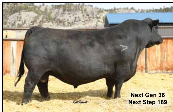
Next Gen 36 Next Step 189