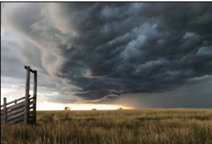
Angus Bull Sale