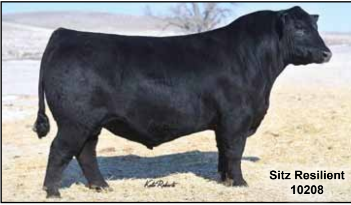
Sitz Resilient 10208