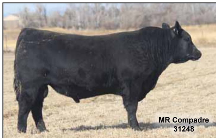
MR Compadre 31248