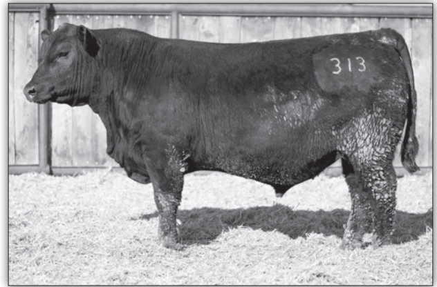
Lot 8 - Vermilion Spur 313