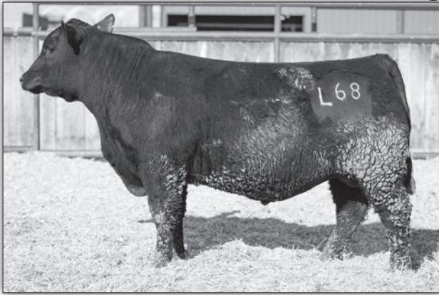
Lot 19 - JVC Spur L68