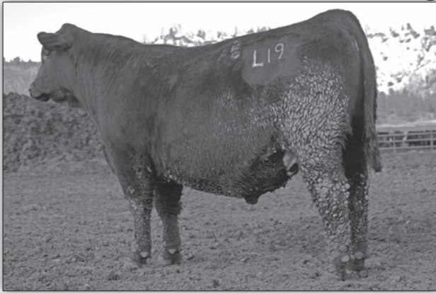
Lot 5 - JVC Exemplify L19