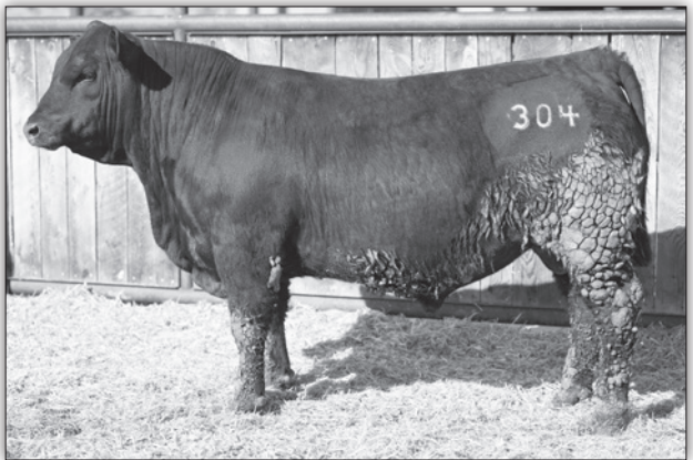
Lot 53 - 304