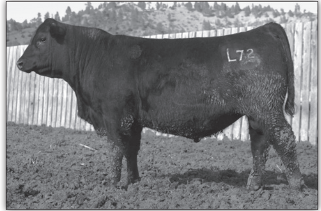
Lot 22 - JVC Thedford L72