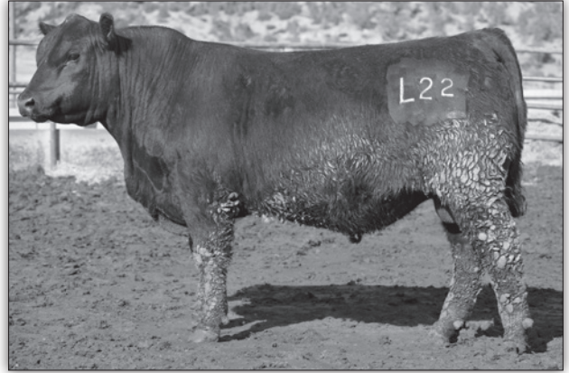
Lot 4 - JVC Spur L22