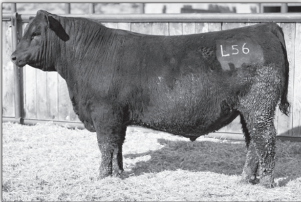
Lot 6 - Trail Boss L56