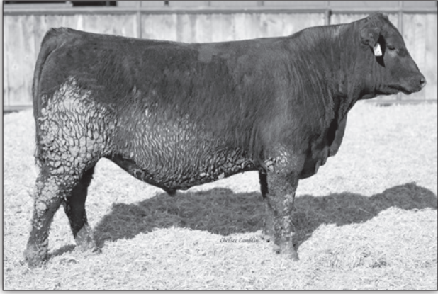
Lot 10 - JVC Powerball L77