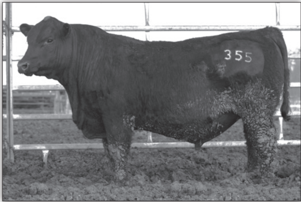
Lot 33 - JVC Spur 355