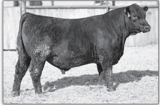
Lot 18 - JVC Growth Fund 399