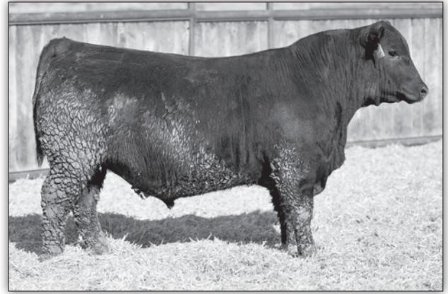
Lot 14 - JVC Spur L47