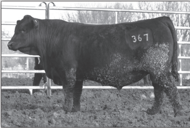
Lot 16 - JVC Growth Fund 367