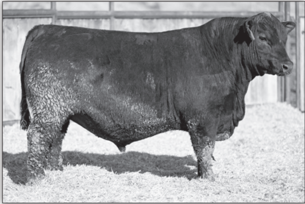
Lot 2 - JVC Man in Black L26