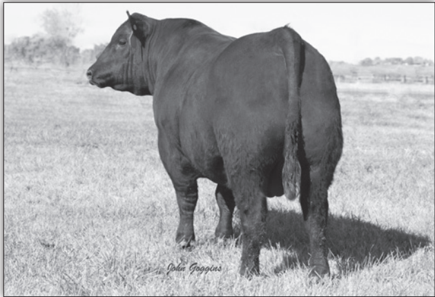
Vermilion Spur E870

#*Connealy Stimulus 8419 #+H A Power Alliance 1025 #*Connealy Spur 17304082 Black Creesa of Conanga 5332 #Jazza of Conanga 8594 #+TC Grid Topper 355 ANGUS #Connealy Dublin 8223 Jemma of Conanga 5614 Vermilion Lass 4942 Connealy Full Freight 18031366 Vermilion Lass 9795 Black Rina of Conanga 69 #+*TC Franklin 619 Vermilion Lass 4752