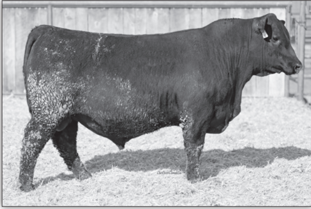
Lot 15 - 310