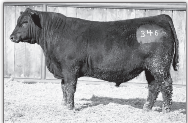
Lot 28 - JVC Growth Fund 346