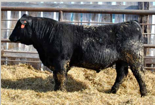
LG102 Sells as Lot 53.