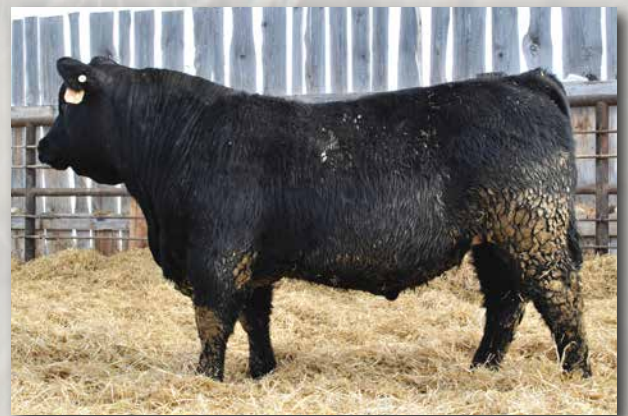
LD300 Sells as Lot 66.