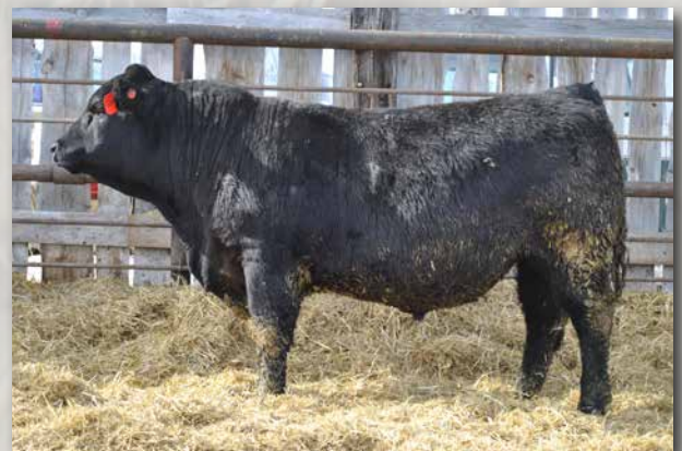
LH439 Sells as Lot 3.