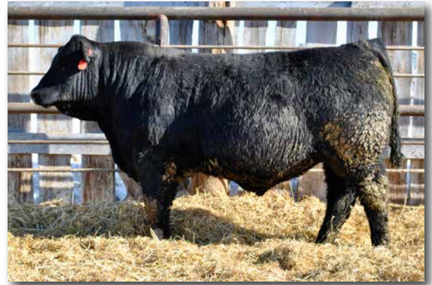
LJ670 Sells as Lot 26.