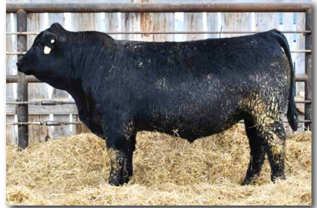
LH506 Sells as Lot 9.