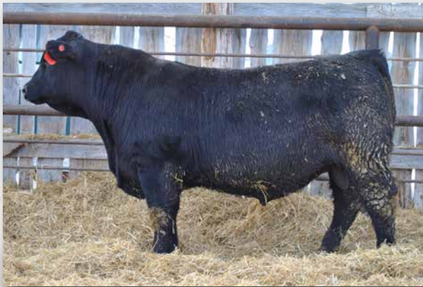
LH321 Sells as Lot 30.