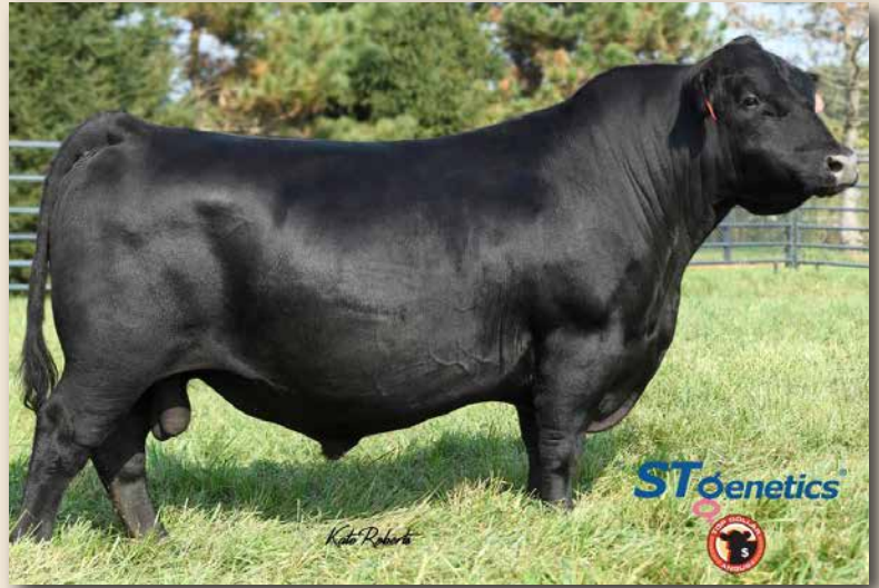
POSS RAWHIDE Reference Sire.

Standing out by progeny data and by popularity, he is siring consistency in growth, practical calving ease and carcass merit. Daughters sport an imposing, broody body style from his impressive phenotype and a powerfully stacked maternal heritage.