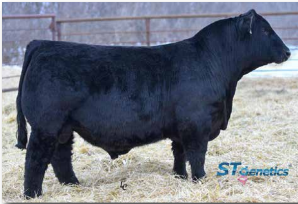
CDI TRUSTEE 387F Sire of Lots 67-71.