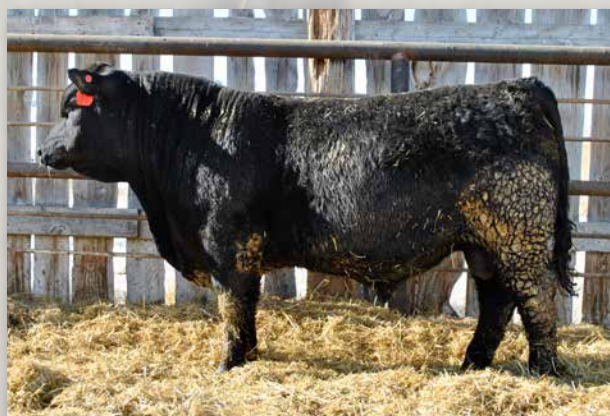
LJ538 Sells as Lot 14.