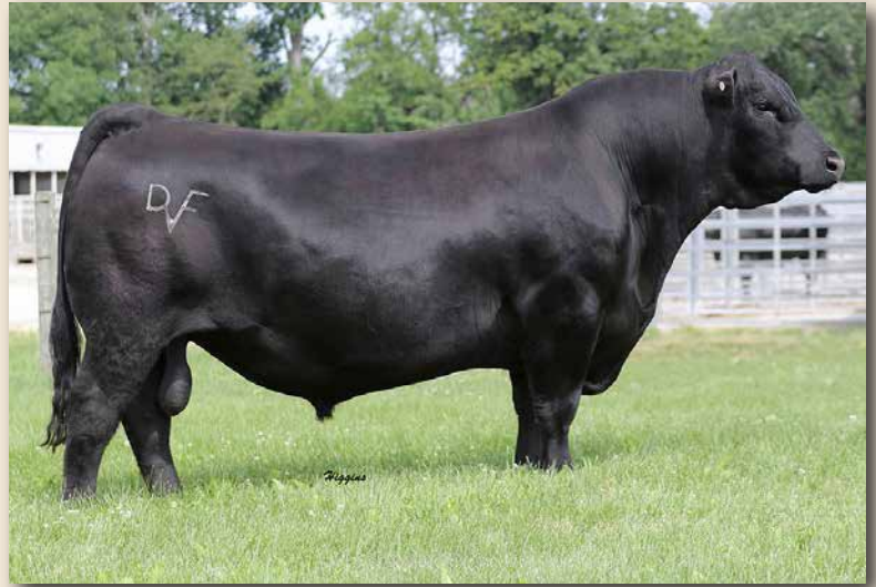
DEER VALLEY GROWTH FUND Reference Sire.

A fresh pedigree for our program that springs from the legendary Basin Payweight and a line of maternal cows that are considered Angus royalty. Capturing attention on paper and in the pasture, he is moderately framed with a powerful hip and rear leg, extra neck extension, a smooth shoulder, wide top and wide base. Capacity for gain readily apparent.