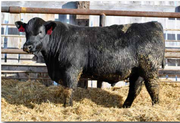
LB677 Sells as Lot 46.