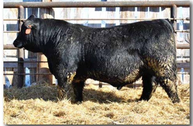
LD249 Sells as Lot 54.