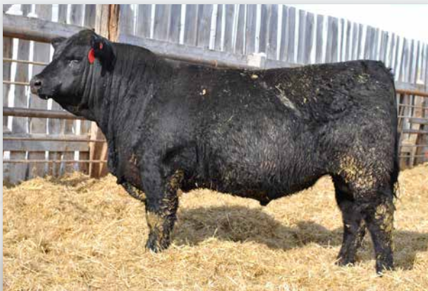
LF740 Sells as Lot 34.