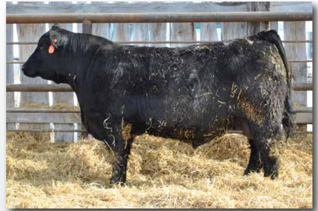
LJ610 Sells as Lot 17.