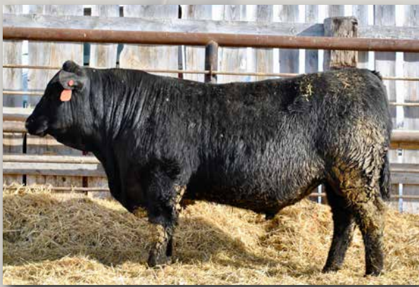
LB732 Sells as Lot 50.