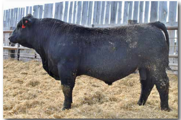
KD75 Sells as Lot 99.