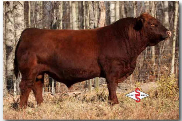
SAS COPPERHEAD G354 Sire of Lots 72-76.