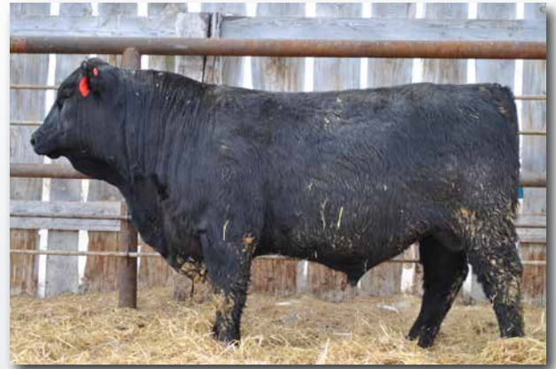
LG337 Sells as Lot 64.