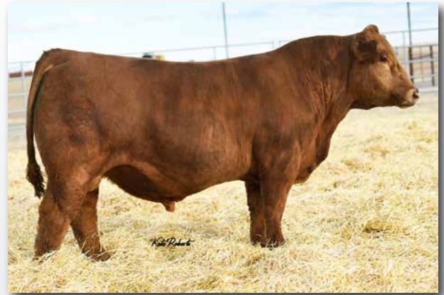
KBHR ALL AMERICAN G104 Sire of Lot 85.