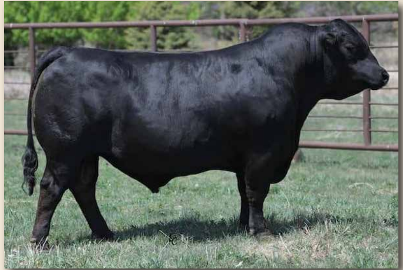
BCLR MANIFESTO G352 Reference Sire.

Deep and expressively muscled, he boasts perfect foot structure with flex and correct movement. He raises the bar higher than his sire's in capacity and structural soundness and brings a long legacy of maternal excellence to the package.