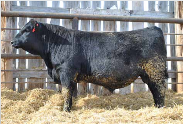
LG103 Sells as Lot 44.