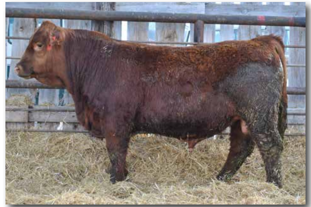
LF737 Sells as Lot 72.