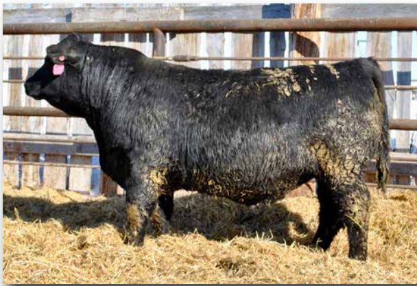
LH328 Sells as Lot 22.