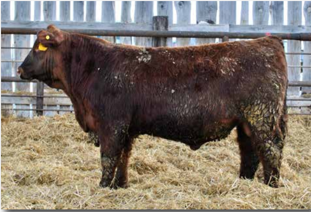
LF752 Sells as Lot 77.