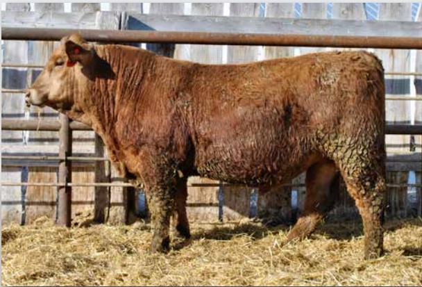
LF593 Sells as Lot 80.