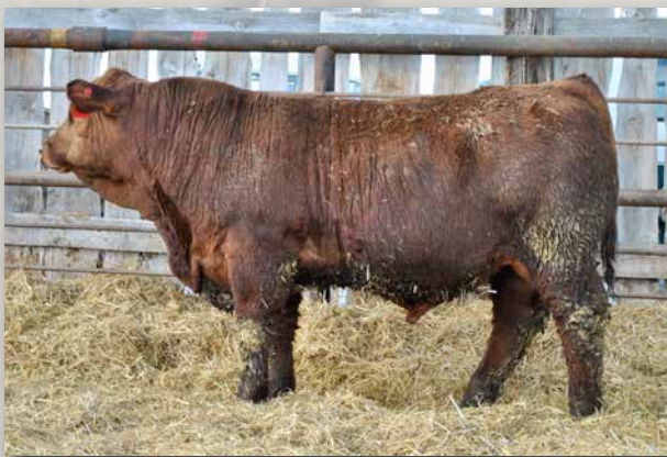
LH346 Sells as Lot 71.