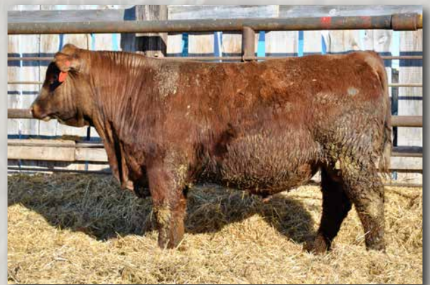
LA600 Sells as Lot 76.