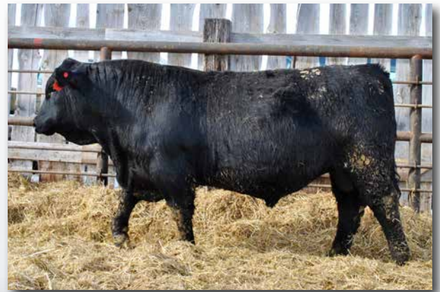
KA590 Sells as Lot 100.