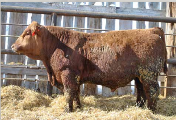
LJ793 Sells as Lot 81.