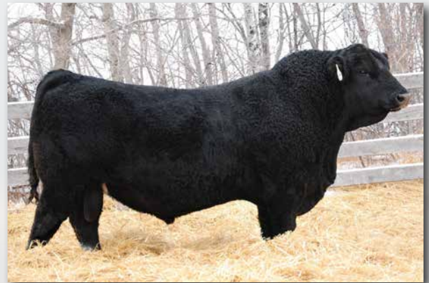
SPRINGCREEK TESLA 6E Sire of Lots 87-90.