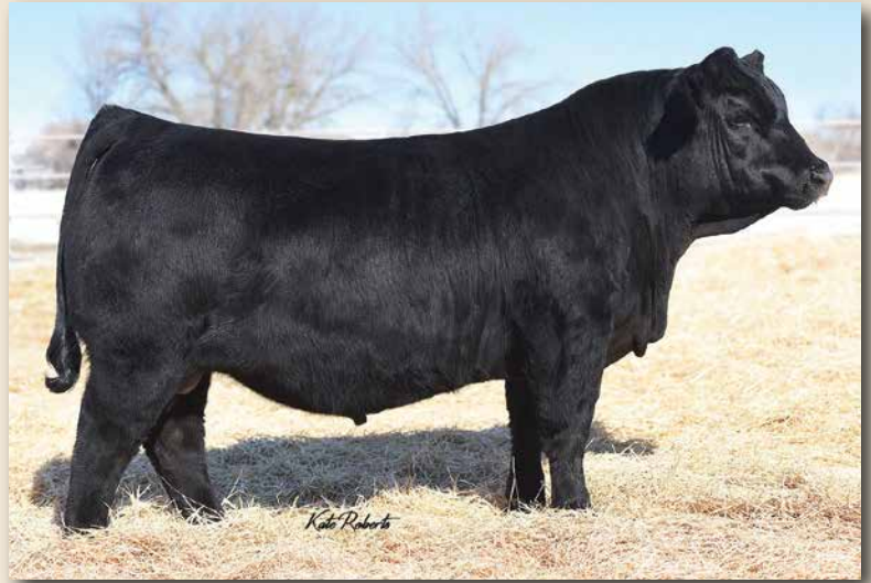
HOOK'S EAGLE 6E Reference Sire.

In his fifth year of siring an impeccable genetic profile that adds value to every segment, this attractive combination of performance and carcass quality is proving consistent, measurable, and versatile. You will notice that our group looks like a matched set, and they have all the way through.