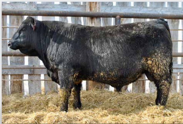
LY30 Sells as Lot 19.