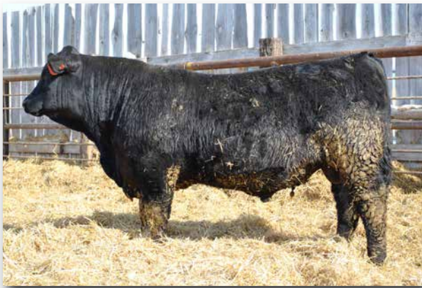
LA459 Sells as Lot 47.