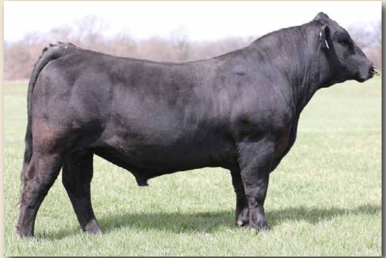
CDI MAJOR IMPACT 280H Reference Sire.

High ranks for growth, elevated performance and product driven offspring. Some Purebred Simmental options here with massive rib eye and sound calving ease that would really compliment a set of traditional Angus cows.