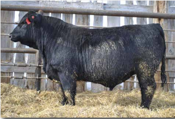
LA523 Sells as Lot 32.