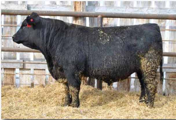
LJ571 Sells as Lot 21.