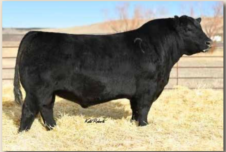
FF CONCLUSION F83 Reference Sire.