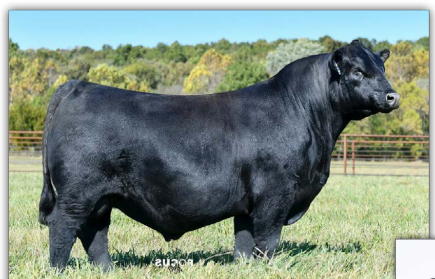
ELLINGSON BADLANDS 0285 - Sire of Lot 20 and 21 Embryos