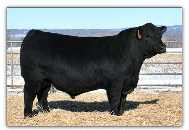
SCHIEFELBEIN GOAT 271 - Sire of Lot 11 Embryos