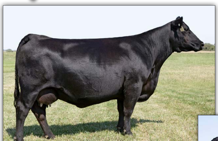
VERMILION E PRIDE LUCY 5213 - Dam of Lot 11 Embryos