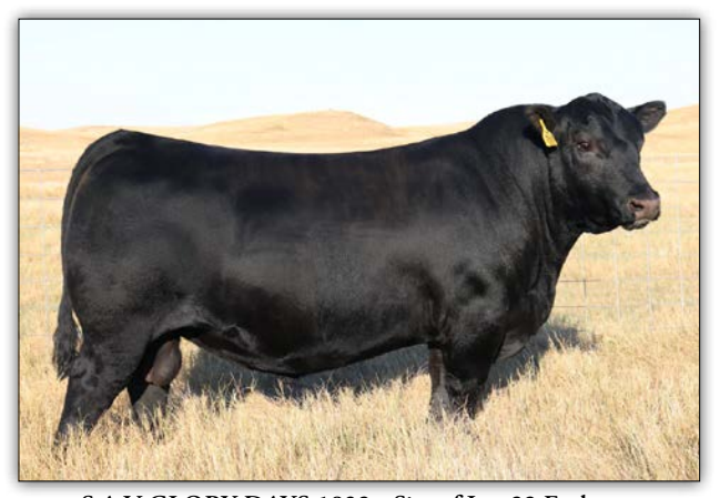
S A V GLORY DAYS 1832 - Sire of Lot 22 Embryos