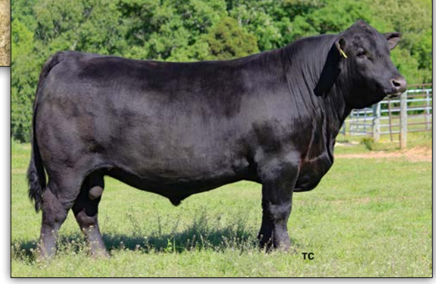
BJ SURPASS - Sire of Lot 18 Embryos

Sired by the pick of the 2021 Ellingson Sale, Ellingson Three Rivers 0065 is a bull that is a high performing and high maternal son of the popular Ellingson Three Rivers 8062. Here is a mating that will give you high performing, stout, and functional cattle!