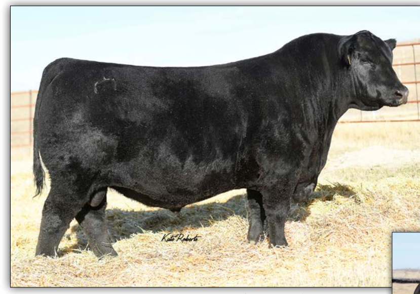
SITZ INCENTIVE 704H - Sire of Lot 15 Embryos