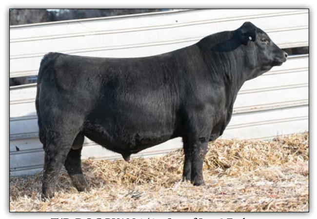
T/D DOC RYAN 049 - Sire of Lot 5 Embryos