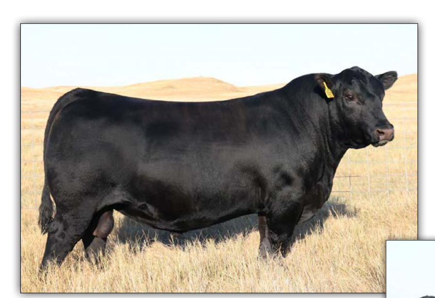
S A V GLORY DAYS 1832 - Sire of Lot 3 Embryos