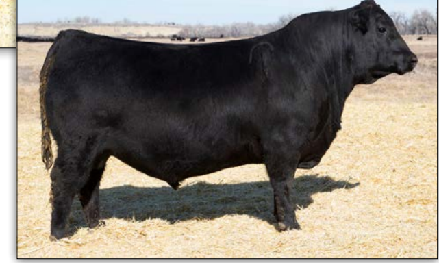
VERMILION THREE RIVERS K179 - Son of Lot 15A Donor Dam and Sells as Lot 33