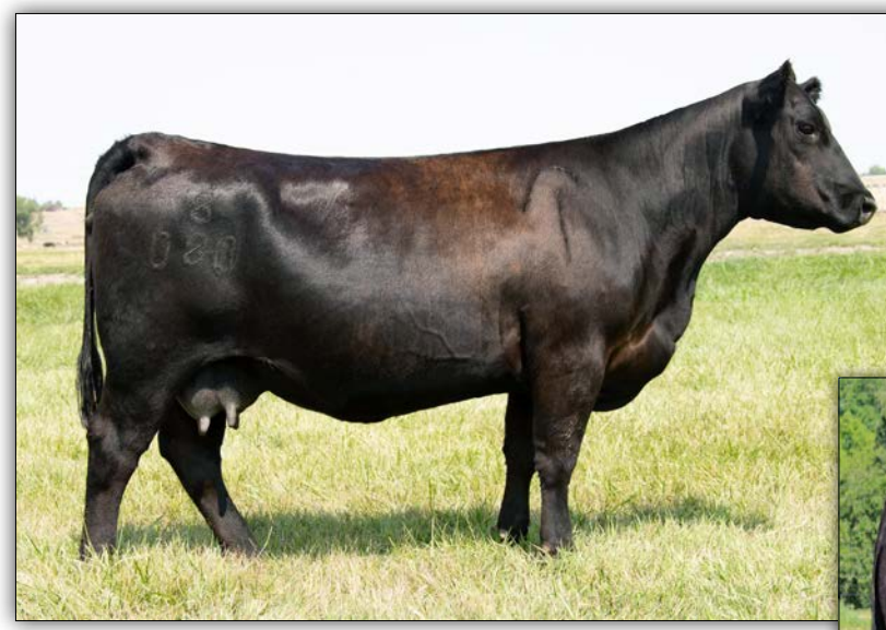
VERMILION EVERGREEN 8080 - Dam of Lot 1 Embryos

Guaranteed 2 live pregnancies if implanted by a certified embryologist.