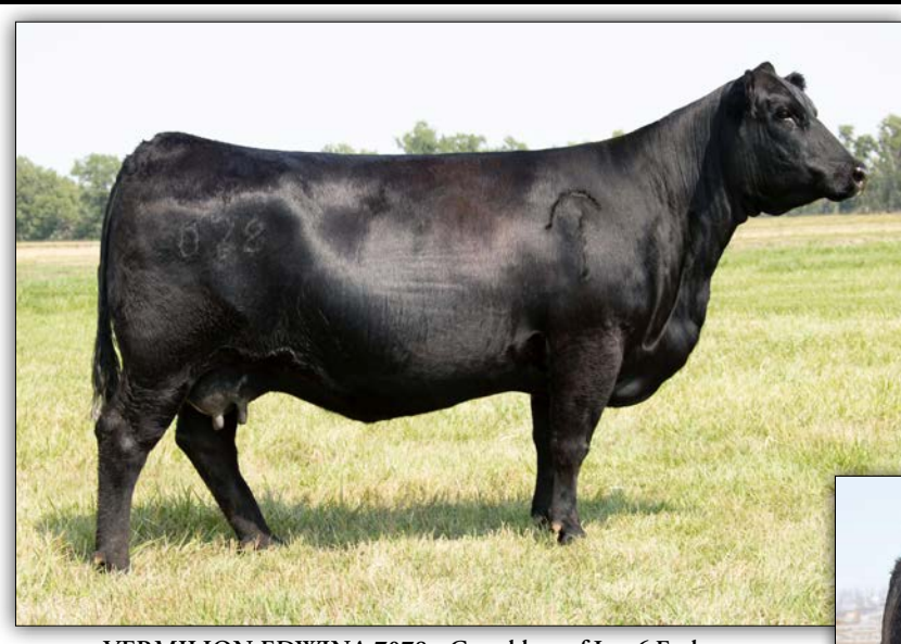
VERMILION EDWINA 7078 - Granddam of Lot 6 Embryos