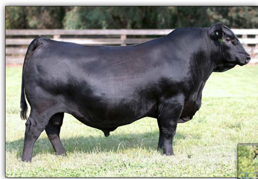
V A R CONCLUSION 0234 - Sire of Lot 13 Embryos