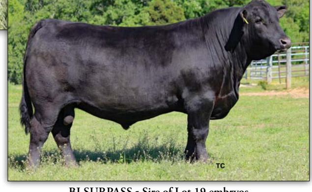
BJ SURPASS - Sire of Lot 19 embryos