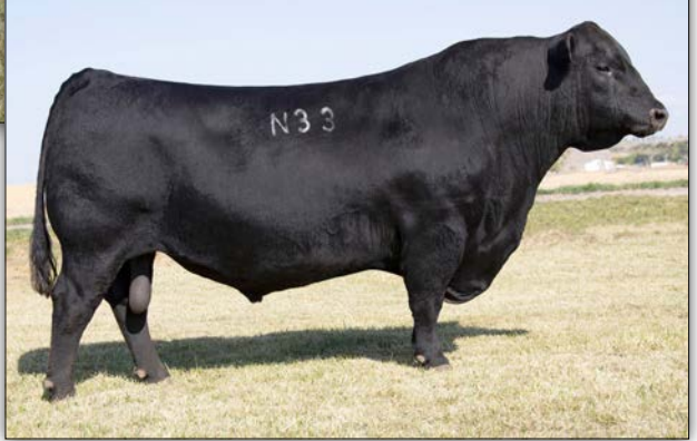
CASINO BOMBER N33 - Maternal Grandsire of Lot 12 Embryos

Sired by the $232,000 Schiefelbein GOAT, one of the most talked about young Angus herd sires in the breed. Out of one of the very best Countdown daughters we have, Vermilion E Pride Lucy 5213, who sold as Lot 358 in our 2022 Fall 7-year-old dispersion. GOAT ranks in the top 1% of the breed for YEPD, as well as top 2% of the breed for WEPD and $W. This pedigree is very outcross for a lot of people and an opportunity for high performing and functional cattle. Performance, top and bottom!