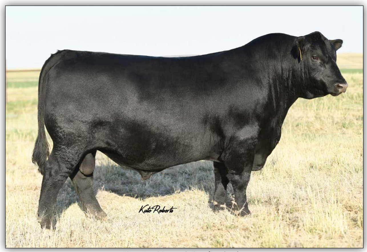
BASIN JAMESON 1076 - Sire of Lot 4 Embryos