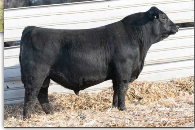
T/D DOC RYAN 049 - Sire of Lot 2 Embryos