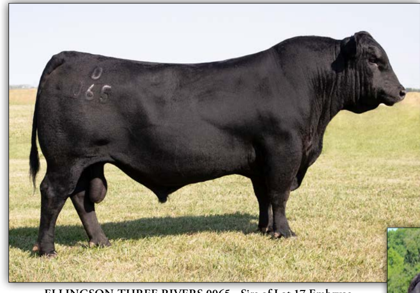
ELLINGSON THREE RIVERS 0065 - Sire of Lot 17 Embryos