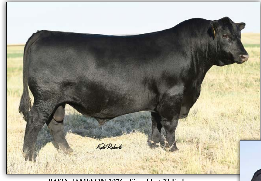
BASIN JAMESON 1076 - Sire of Lot 23 Embryos