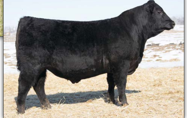
VERMILION BOMBER G017 - Sire of Lot 6 Embryos