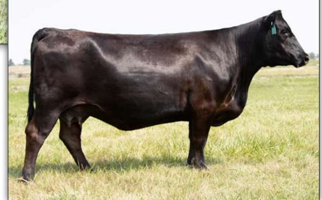
VERMILION LASS 7176 - Dam of Lot 21 Embryos