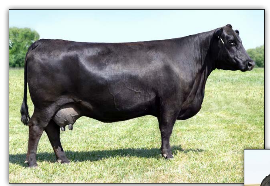
VERMILION BARB 9513 - Dam of Lot 7 Embryos