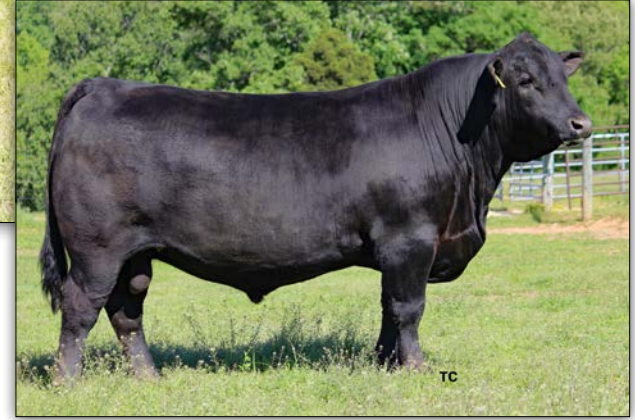
BJ SURPASS - Sire of Lot 1 Embryos