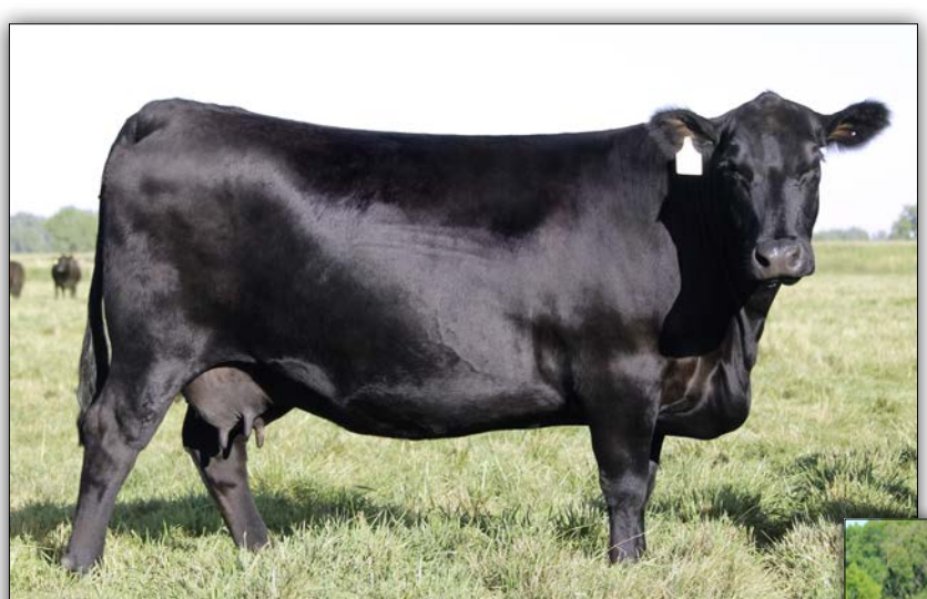
VERMILION BLK JESTRESS 5320 - Dam of Lot 19 Embryos