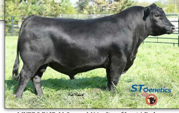
MYERS FAIR-N-Square M39 - Sire of Lot 14 Embryos