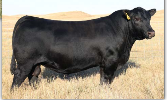
S A V GLORY DAYS 1832 - Sire of Lot 9 Embryos

OPPORTUNITY IN THE MAKING! Sired by the $82,500 popular sire SAV Glory Days out of one of our very best Spur granddaughters, Vermilion Enchantress 8252. Here is an opportunity to put forth the very best maternal traits the breed has. SAV Glory Days, which is out of the famous SAV Madame Pride 3145 with this crossing of a Connealy Spur granddaughter, could be the next big thing. Performance and Maternal all in one package. Don't miss out!