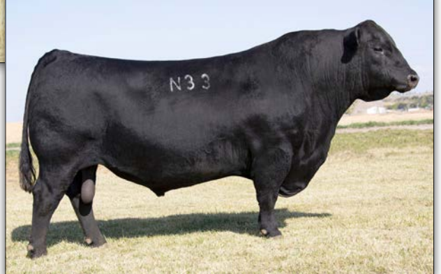
CASINO BOMBER N33 - Maternal Grandsire of Lot 23 Embryos

Sired by our pick of the 2022 SAV Sale, SAV Glory Days. SAV Glory Days is a bull we used very heavily in our herd for his high performance and high maternal genetics. Vermilion Princess 5322 is a Pathfinder cow with progeny weaning ratios of 108 and yearling ratios of 107.