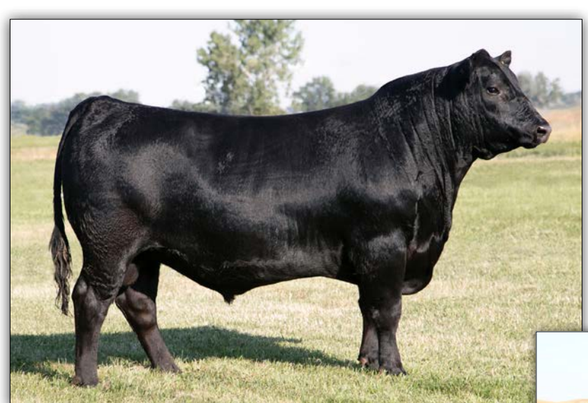
VERMILION LEO - Sire of Lot 10 Embryos