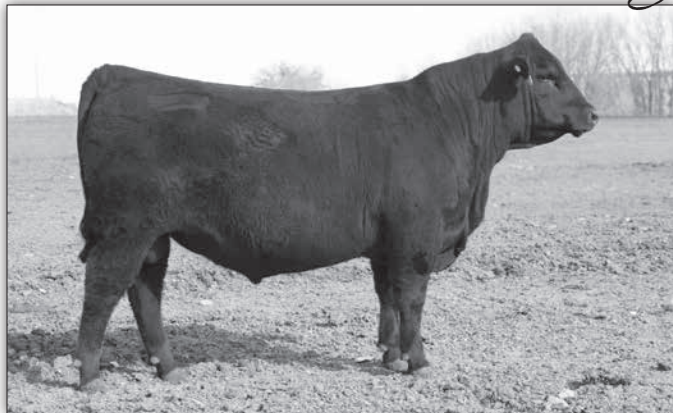
JVC Cavalry 29 - Lot 2