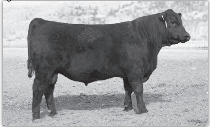
JVC Spur 2029 - Lot 48