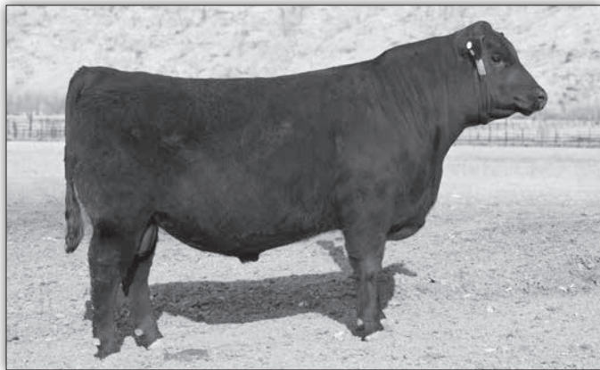
JVC Spur 247 - Lot 21