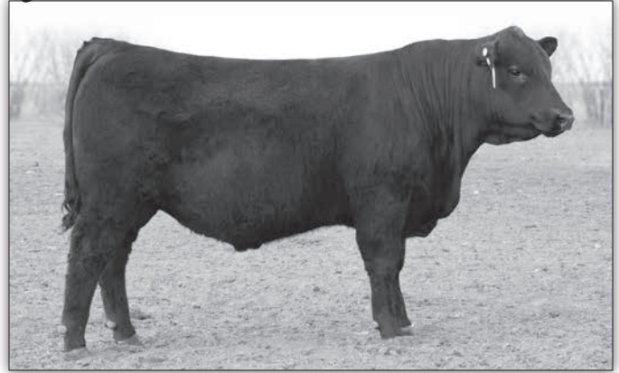
JVC Spur 299 - Lot 36