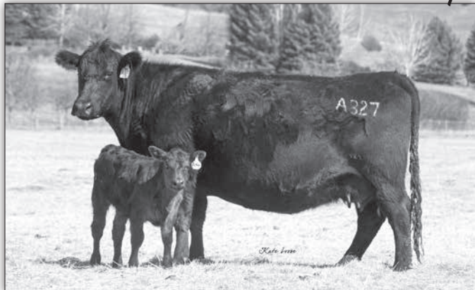
JVC Lucy A327 - Lot 88