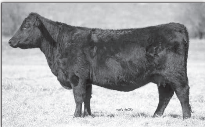
JVC Everelda Entense 930 - Lot 95

Lot 94A JVC Ideal 2164 || Cow 20026456 BW: 74 Sire: T/D Tiger 8106 (19142087)