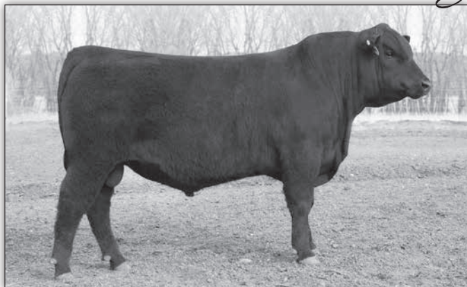
JVC Spur 206 - Lot 6

BD: 01-16-2020 | BULL +19643769 | TATTOO: H5