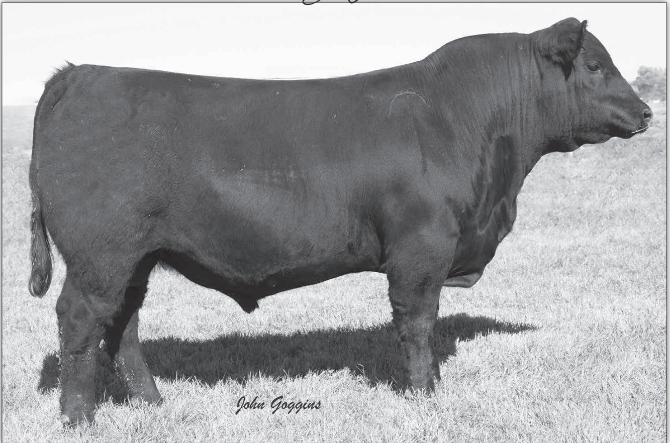
Vermilion Spur E870