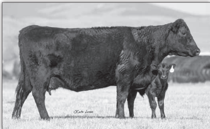
JVC Primrose Y101 - Lot 84

Lot 87A JVC Spur 21153 || Bull 20026466 BW: 92 Sire: Vermilion Spur E870 (19053226)