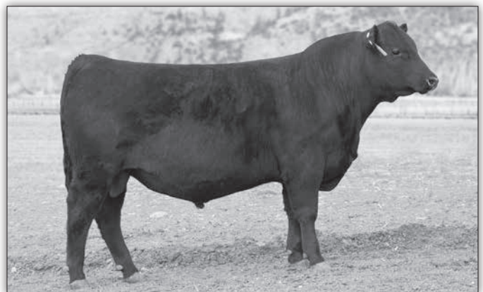
JVC Spur 279 - Lot 28