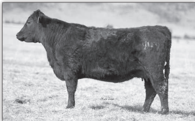
JVC Precision 949 - Lot 97

Lot 96A JVC Tiger 2196 || Bull 20026470 BW: 64 Sire: T/D Tiger 8106 (19142087)