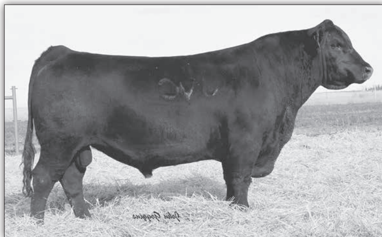
JVC Cavalry V3326 - Sire of Lots 2, 5