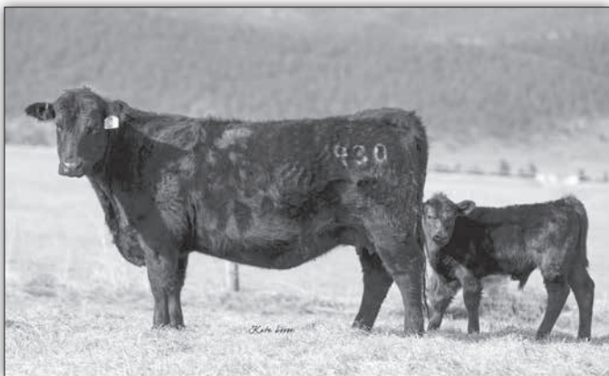
JVC Everelda Entense 930 - Lot 95