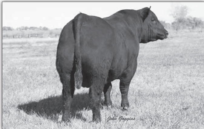
Vermilion Spur E870