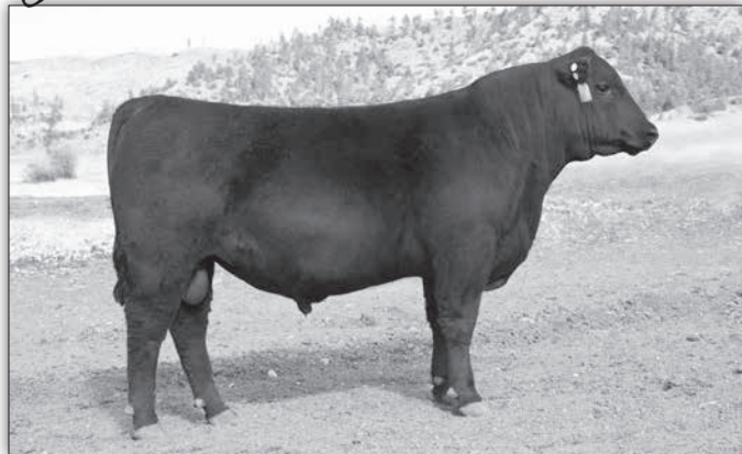
204 - Lot 4