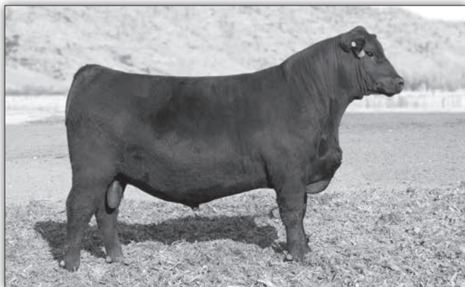
JVC Capitalist H7 - Lot 7