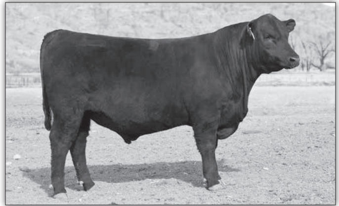
JVC Spur 260 - Lot 23