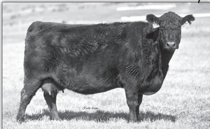
JVC Ideal 942 - Lot 83

Lot 85A JVC Spur 21150 || Bull 20026469 BW: 76 Sire: Vermilion Spur E870 (19053226)