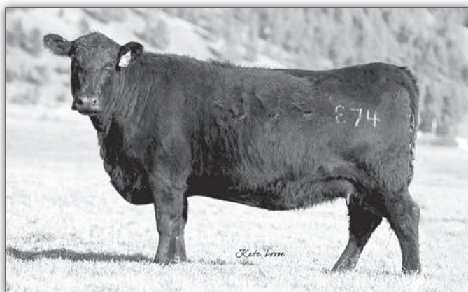
JVC Blackbird E74 - Lot 90

Lot 90A JVC Spur 21149 || Bull 20026465 BW: 80 Sire: Vermilion Spur E870 (19053226)