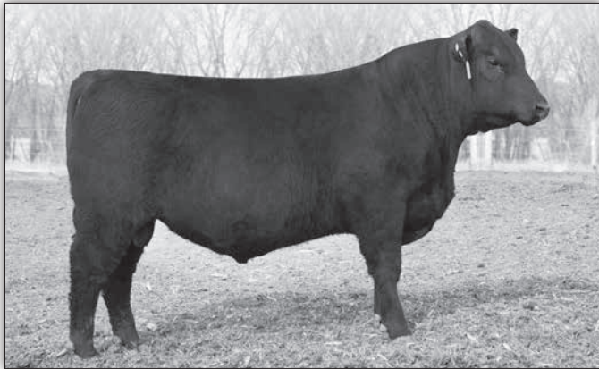
JVC Spur 2025 - Lot 47