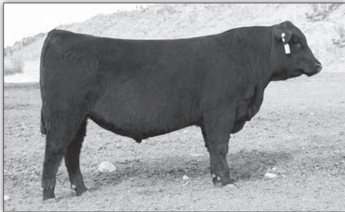
JVC Spur 2040 - Lot 53