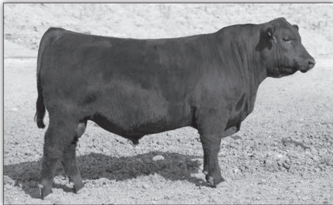
JVC Tiger 239 - Lot 14