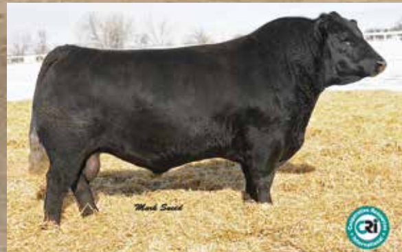
Cole Creek Cedar Ridge 1V 13 Sons Sell.

GDAR Game Day 449 sires progeny in an eye appealing package with thickness, length, volume and hindquarter. In the same mold as Emblazon 854E, he is a consistent breeding bull that sires calving ease and performance in a moderate framed package. He sires efficient, excellent uddered daughters, that make a living on grass.