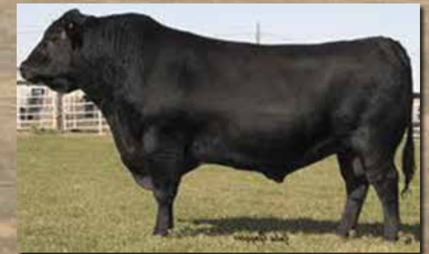
Wulfs EXT 6106 18 Grandsons Sell.

A high volume, easy doing, big REA sire. This group of sons looks very strong. Paxton sires extra volume, muscle & fleshing ability along with a +36.09 $EN score that reflects the efficiency his daughters are transmitting.