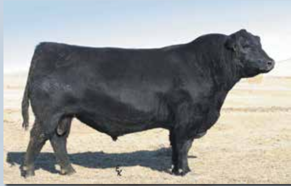
GDAR Game Day 449 27 Sons Sell.

GDAR Game Day 449 sires progeny in an eye appealing package with thickness, length, volume and hindquarter. In the same mold as Emblazon 854E, he is a consistent breeding bull that sires calving ease and performance in a moderate framed package. He sires efficient, excellent uddered daughters, that make a living on grass.