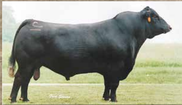
Papa Forte 1921 6 Sons Sell.

Cedar Ridge is a total outcross sire for our program. He has worked very well in our herd siring the same type & kind that we like. We plan on using Cedar Ridge extensively in the future. Excellent calving ease & Calf vigor. His daughters will be moderate framed and easy fleshing with good udders.