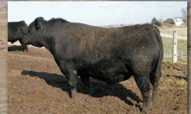
OCC Paxton 730P 33 Sons Sell.

OCC Emblazon 854E is recognized as the cow efficiency leader in the angus breed. Over 90 bulls sell carrying his influence. Daughters are easy fleshing with superb udders. He is a dominant, uniform sire that combines big REA with calving ease & high $EN & $W.