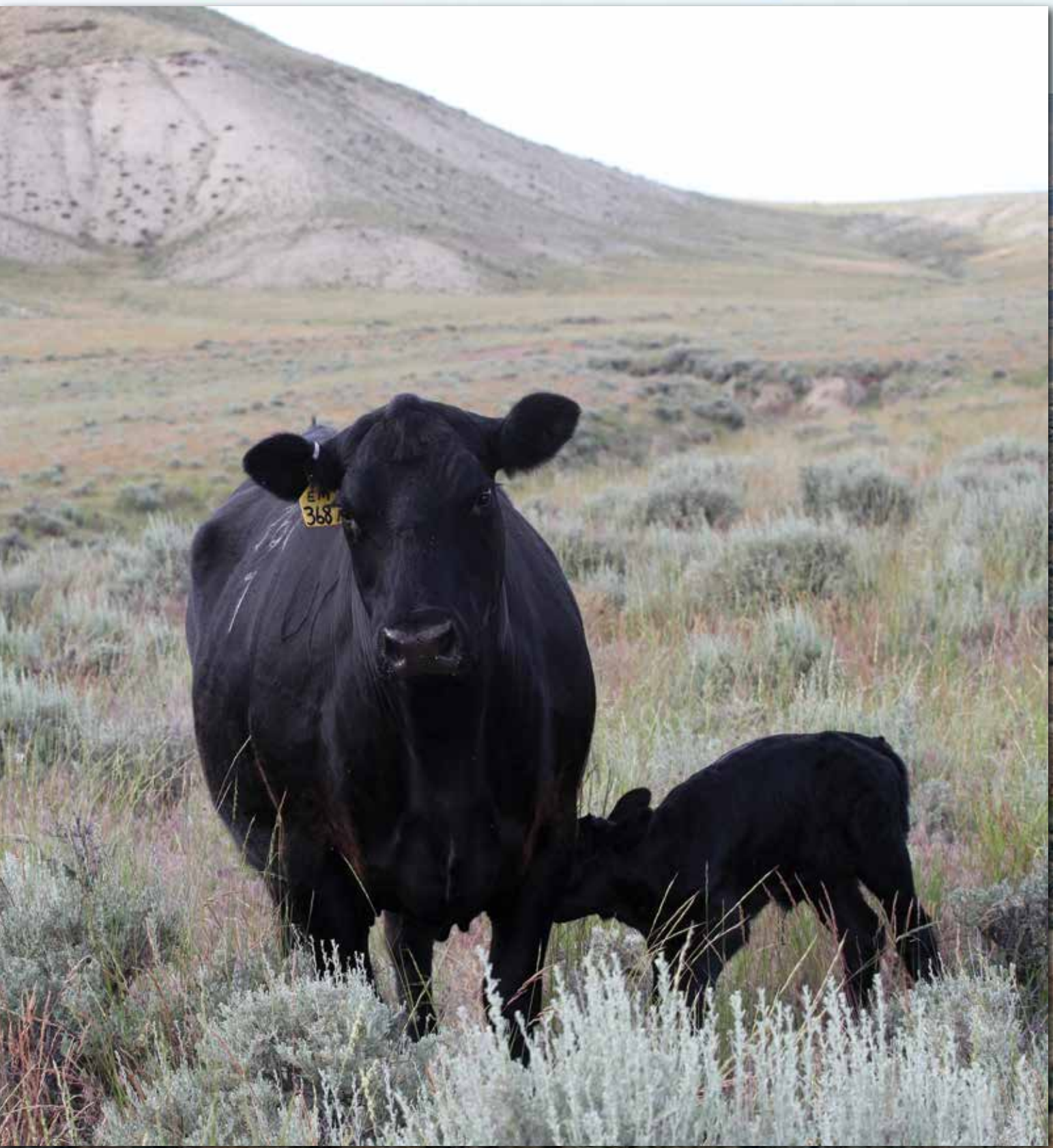
RANGE CALVED-RANGE RAISED® cows must be fertile, early maturing & easy fleshing. They must be able to calve unassisted, and take care of their calves on their own, in a range environment.